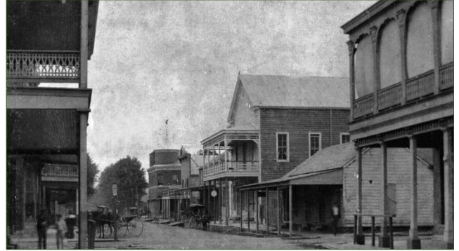
Figure 1 – Historic Downtown Opelousas. Louisiana's third oldest city, many original buildings still stand today.

Historically economically dependent on cotton and cattle, the city has since expanded its economy to include petroleum and natural gas extraction. Fondly known as the "spice capitol of Louisiana", Opelousas is also home to large seasoning product manufacturers Tony Chachere's and Targil Seasoning. Ventura Foods, which produces Lou Ana cooking oil and products, has a location in Opelousas. On the outskirts of the city is Savoie Products, Inc., a large company that offers authentic Cajun sausage and food products. Throughout the years,