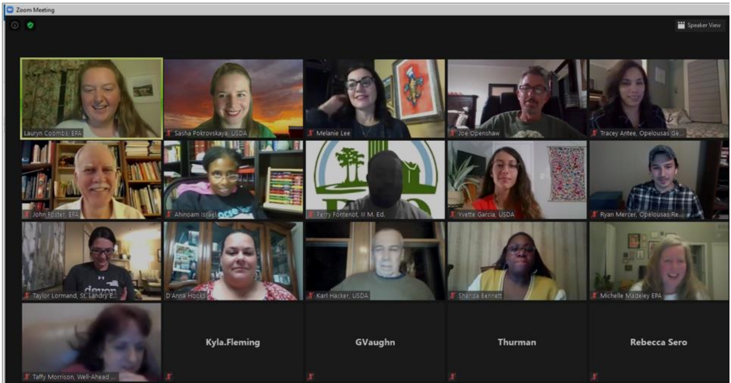
Figure 8 – Workshop participants were connected virtually through six videoconferencing sessions.