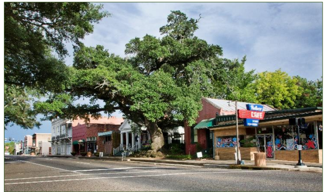
Figure 4 – A stroll along Landry Street highlights Opelousas’s downtown corridor, containing beautiful tree-lined streets and historic buildings.

Over time, the arrival of the interstates and magnetic draw of big commercial stores has lured businesses and services away from the downtown Main Street area, leaving huge gaps both in the physical fabric and the social activity in the area. A once thriving agriculture parish, this industry has declined throughout the years and the number of farmers and producers have dwindled to only a handful of farmers selling fresh produce at the Farmers Market in Opelousas. However, Opelousas, an accredited Main Street Community, has made great strides towards downtown revitalization.