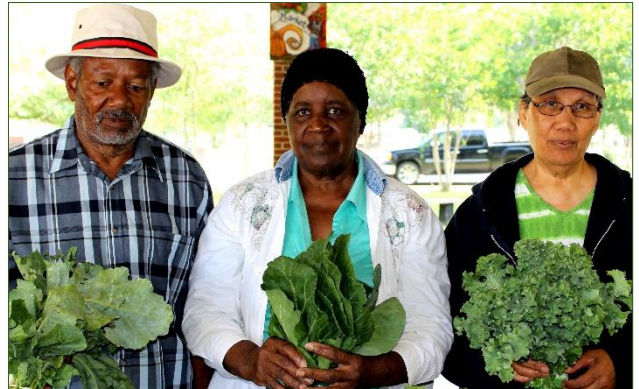
Figure 12 – Among other topics, the workshop considered Opelousas's existing farmers market as a source of local food and community building.