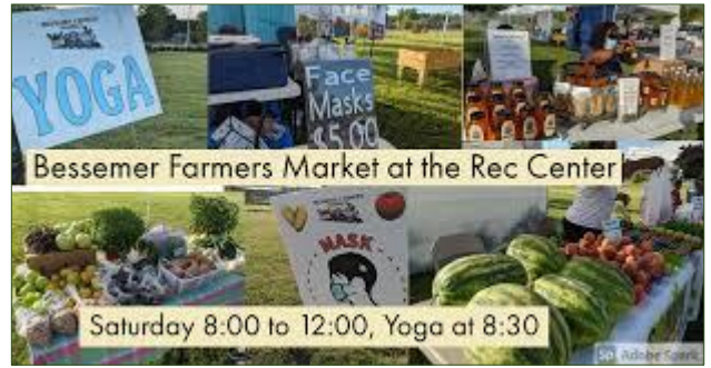
Figure 10 – The technical assistance team invited Bessemer, Alabama, a previous Local Food, Local Places recipient, to share more about their activated farmers market space outside the Recreation Center.

Workshop participants expressed interest in the idea of a community or demonstration kitchen within the downtown as a place for both residents and visitors to learn about healthy and local cooking and eating. Some participants were interested in establishing a community garden near downtown to provide fresh, local food to a nearby group of diverse residents. Others were interested encouraging greater use by farmers and producers of the existing Opelousas Farmers Market.