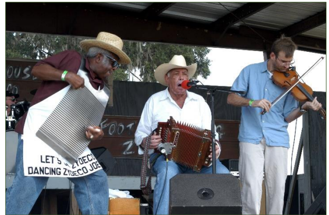
Figure 2 – Known as the "Zydeco Music Capitol of the World", Opelousas's vibrant arts culture is influenced by the distinct and soulful sounds of zydeco music, which originated in the city.